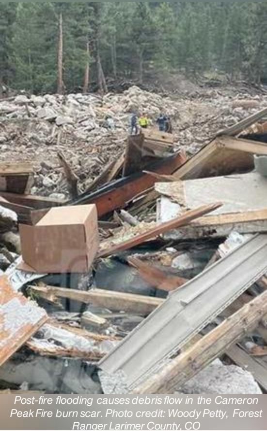
Post-fire flooding causes debris flow in the Cameron Peak Fire burn scar.