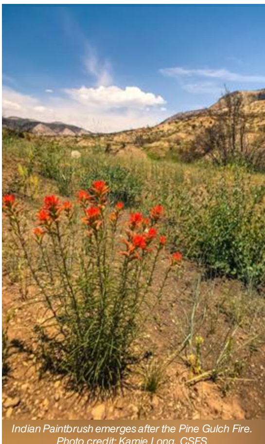
Indian Paintbrush emerges after the Pine Gulch Fire.