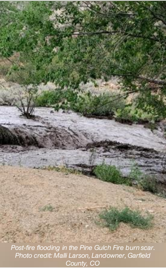
Post-fire flooding in the Pine Gulch Fire burn scar.