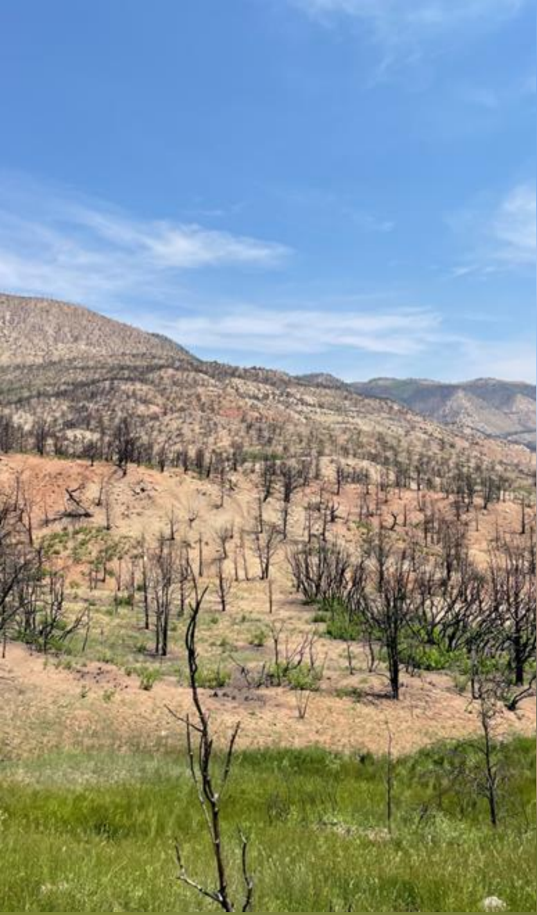
Pine Gulch Fire burn scar, Garfield County, CO.