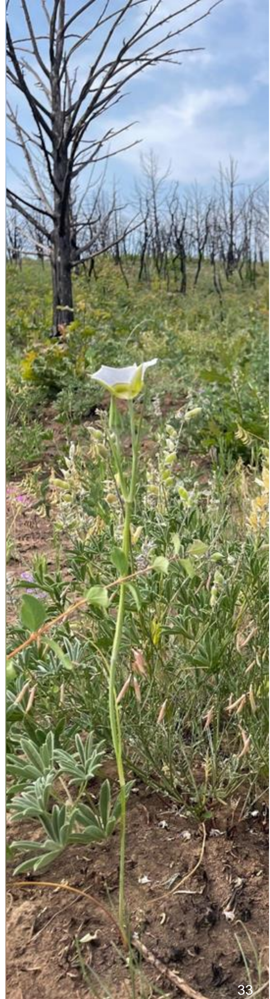
Segoly lily emerges in the Pine Gulch Fire burn scar.