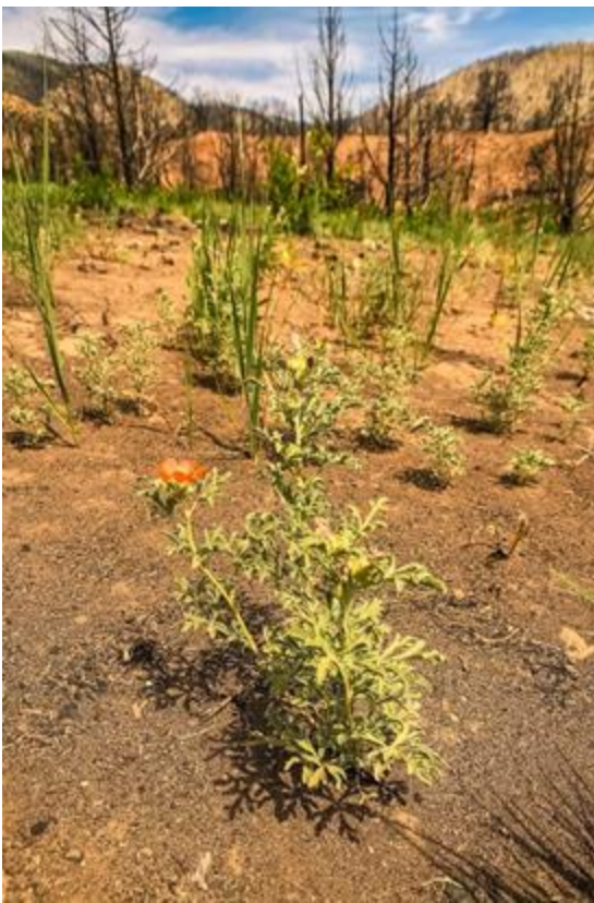
Globe Mallow regrows in Pine Gulch Fire burn scar.